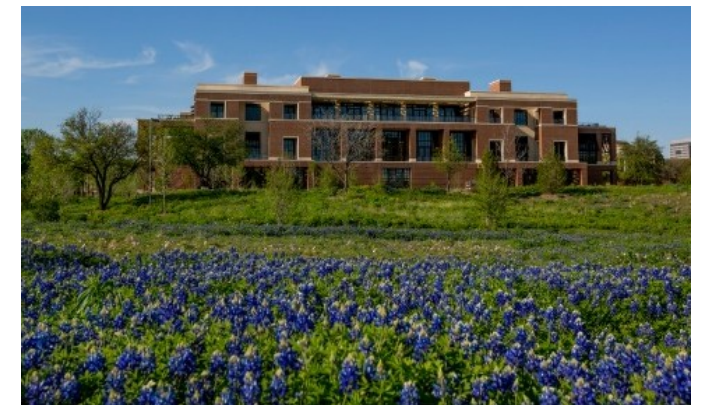
The Bush Center from the south, overlooking the Native Texas Park.

A one mile network of paths will take you through native Texas environments such as Blackland Prairie, Post Oak Savannah and Cross Timbers Forest.