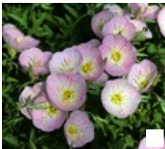
Pink Evening Primrose