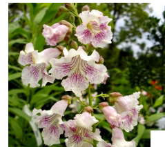
Morning Cloud Chitalpa