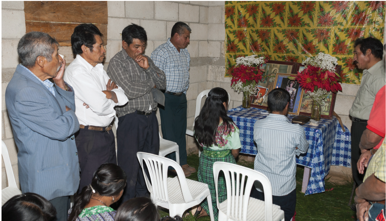
Indigenous Kaqchikel family members gather in a bride's home to ask for her hand in marriage, in Chimaltenango, Guatemala

dealing with gender-based violence—worsens discrimination and the stigmatization of victims when crimes are reported.