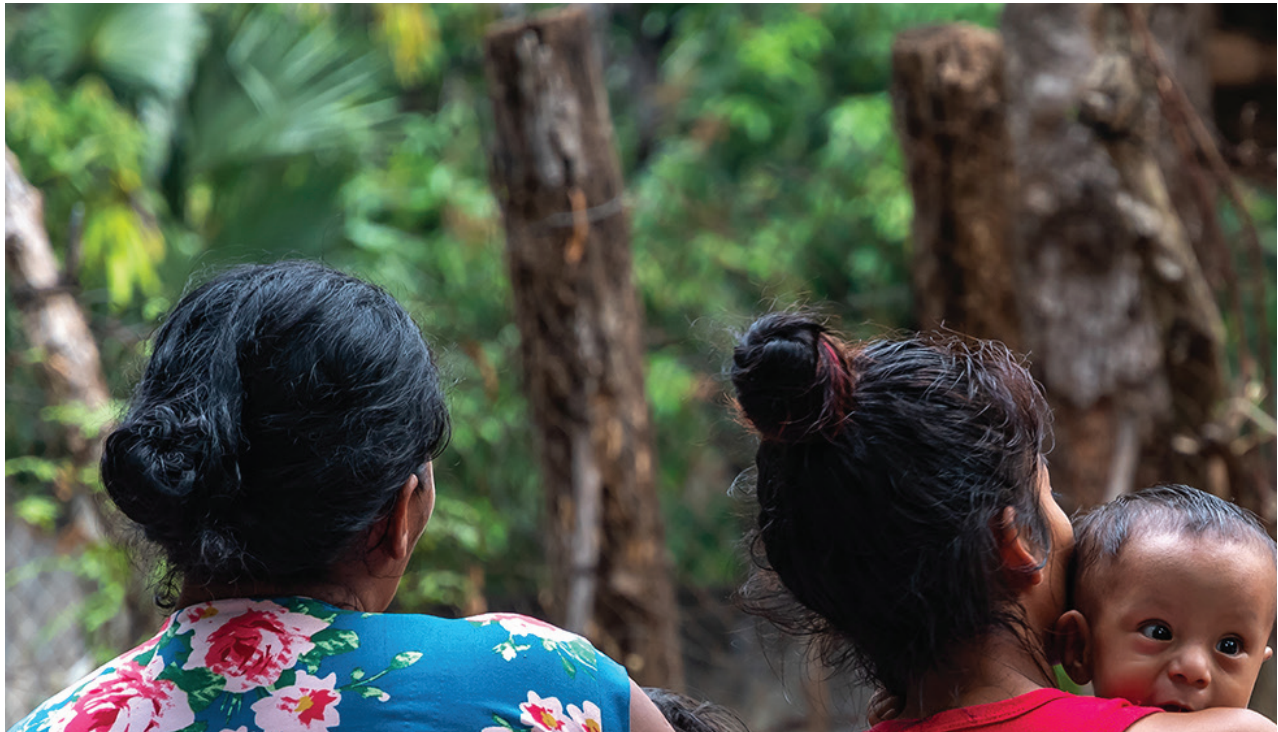
Photo Credit: A Guatemalan mother with her child in Guazacapán, Guatemala: Kyle M. Price, Shutterstock, November 2018

2020, an average of 11 women were murdered each month in El Salvador, with half of them under the age of 31. 6