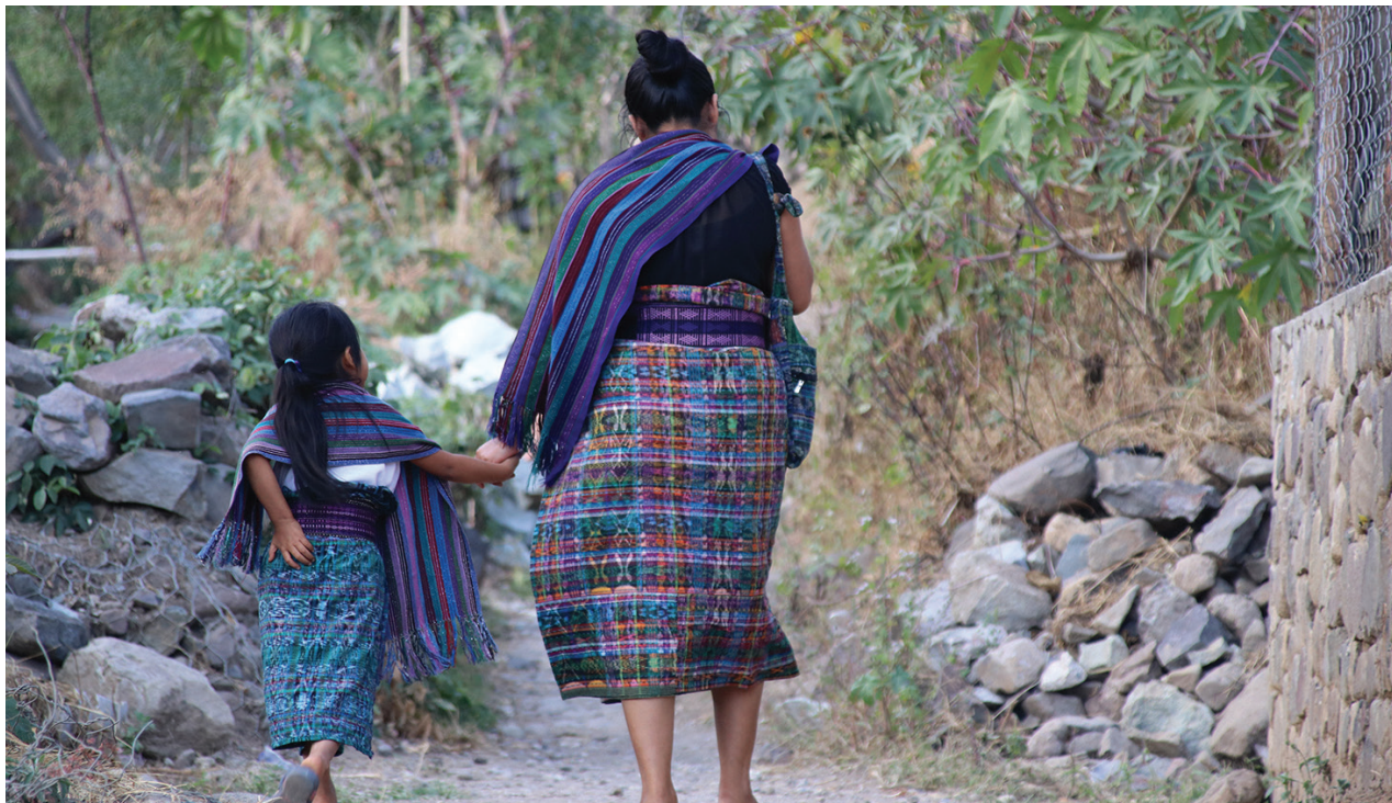
Photo Credit: Indigenous Guatemalan mother and daughter walking in a rural village in Guatemala: Omri Eliyahu, Shutterstock, April 2019