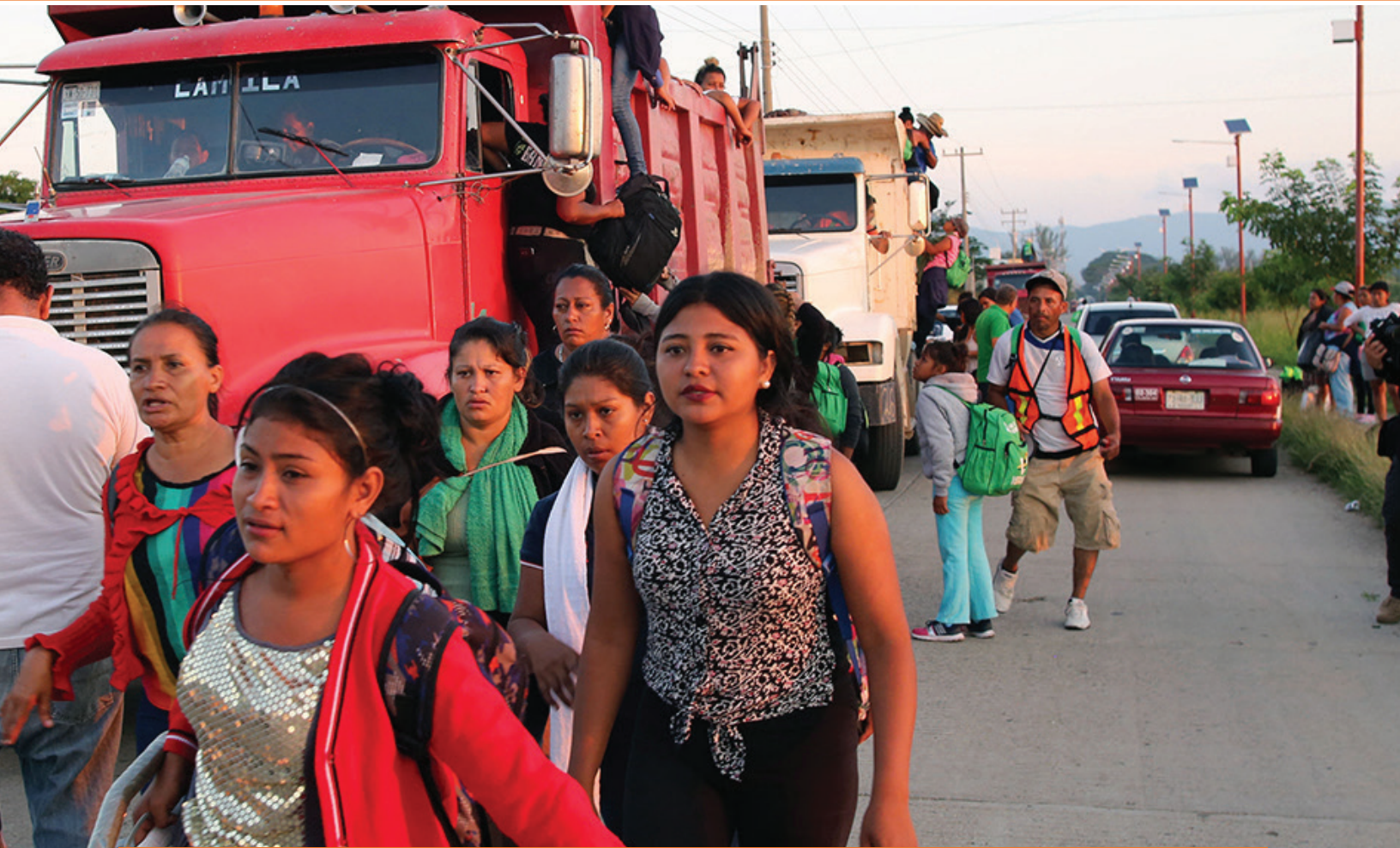
Photo Credit: Honduran women fleeing poverty and gang violence, at a stopover point in Oaxaca, Mexico, en route to the U.S.: Vic Hinterlang, Shutterstock, November 2018