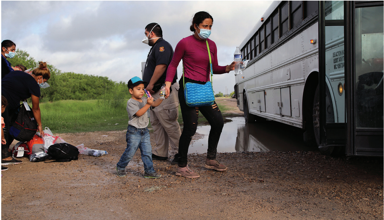
Photo credit: A Central American asylum seeker boards a bus with her son in La Joya, Texas, that's headed to a border patrol station: Vic Hinterlang, Shutterstock, May 2021

El Salvador, Guatemala, and Honduras all have statutes that outline protections and support for women and girls impacted by violence. However, lack of enforcement, corruption, and serious resource challenges regularly undermine access to justice for women within the region, reinforcing a cycle of inequity and gender-based violence.